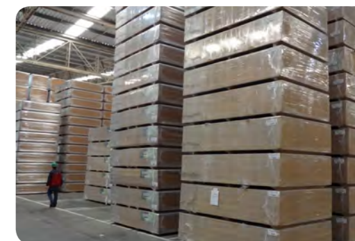
High quality MDF packages in storage