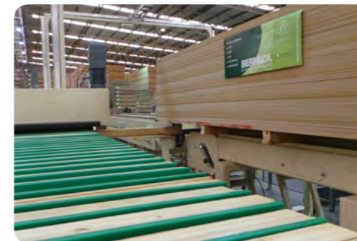
Automatic bottom skid feeding

CM BOARD PACKAGING LINES automatically wrap your boards without straps, saving the cost and trouble of a strapping unit. The unique advantage is that CM packaging lines automatically wrap different sized packages on the same line.