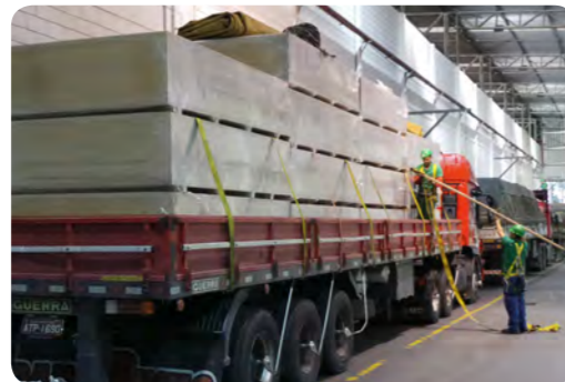
MDF transport in Brazil