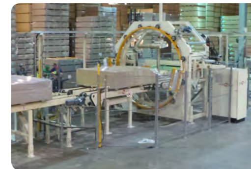
Cross Wrap MDF packing line