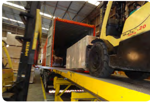
MDF loading in South America for export