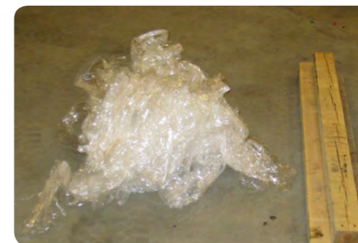
Recyclable packing material