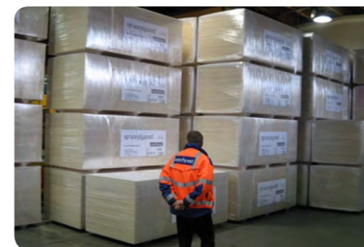
Plywood packages stay in good shape in storage