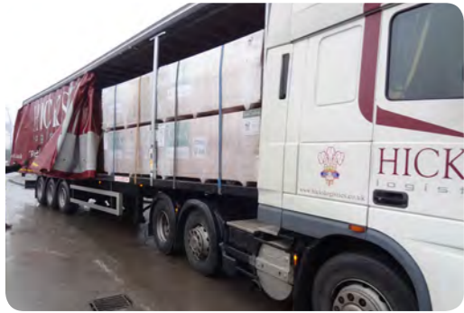
Plywood delivery from South America to UK