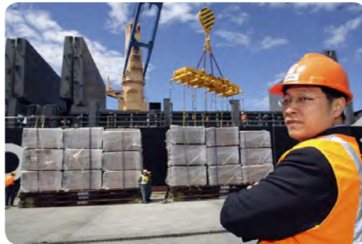
Veneer transport from Tasmania to Asia